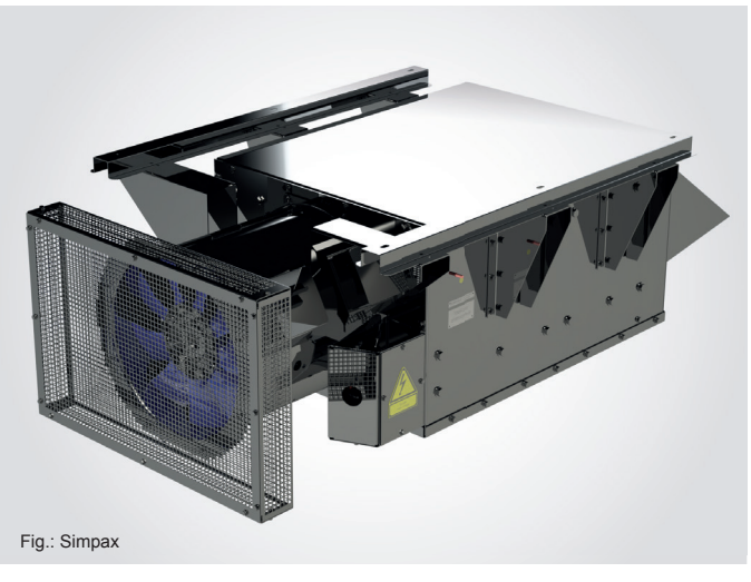
Brake resistor highly efficient medium-pressure fan series DN