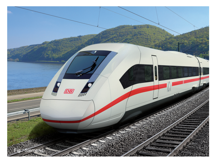
ICE4, ventilation module, GR..Cpro