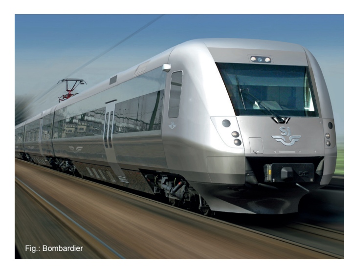
Bombardier Intercity Regina RG..Z design high-pressure fan