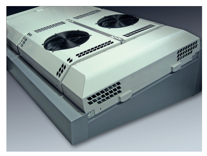
Passenger compartment air handling units for various types of train FE2owlet with ZAplus nozzles