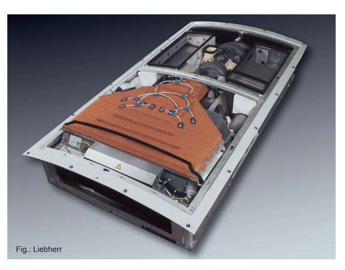
ICE3 high-speed train Roof-mounted air handling unit with RF22P housing fan